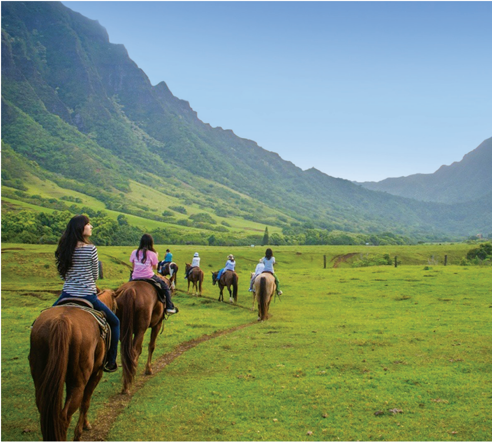
▲ See the spectacular scenery of “Jurassic Valley” on horseback in Kualoa Ranch.

Established in 1850, Kualoa Ranch Private Nature Reserve is owned and managed by eighth generation descendants. Their mission is to enrich people’s lives by preserving the sacred lands and celebrating its history. Their vision is to be a role model as stewards of these amazing 4,000 acres.